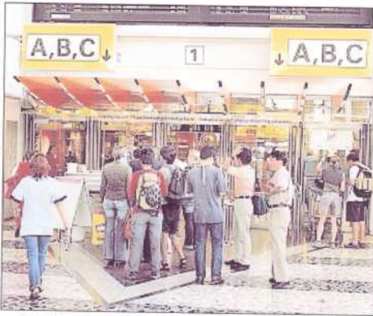
Die Video-Augen überwachen und analysieren jede Situation