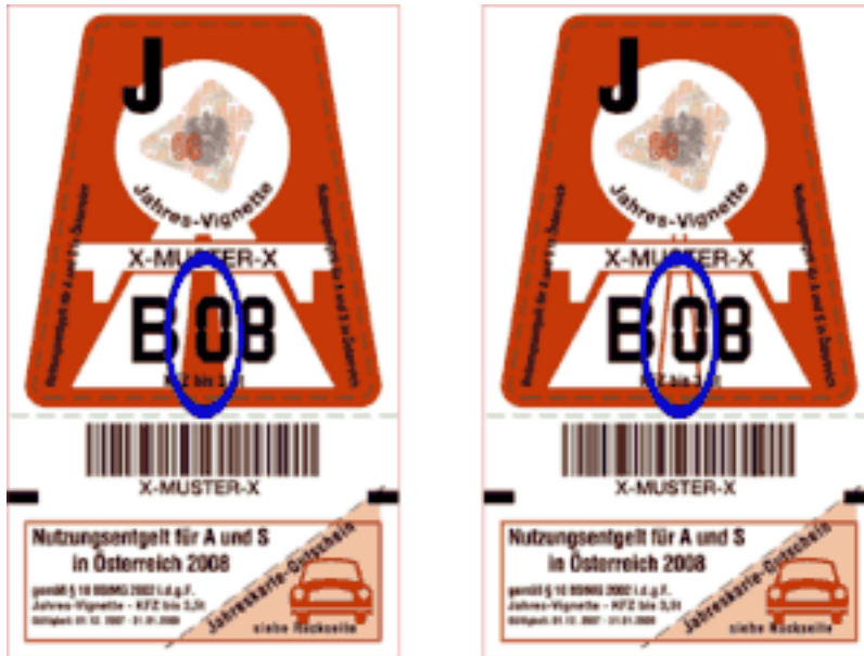
Figure 3: Toll sticker design change 61

provided by an ARBÖ press release (a14) on Dec. 19th 2007. The annual toll sticker entitles motor vehicles to use toll roads during the calendar year as indicated on the toll sticker. It is valid from December 1st of the preceding year until January 31st of the following year 60 . This meant in this case that the annual toll sticker 2008 was valid from December 1st 2007 up until, and including January 31st 2009. The confusion reported was due to two different versions of the toll sticker as can be seen on the images below: